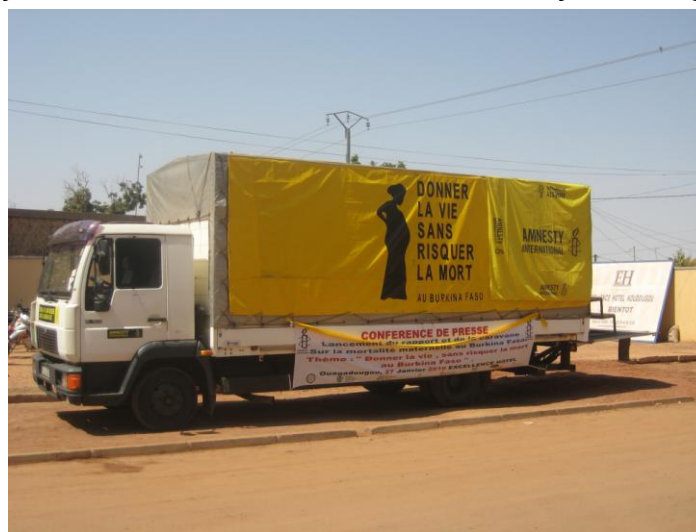
Amnesty International is working in Burkina Faso to promote the right to health care services for women and girls. The banner on this truck says “Give life without risking death”.

The government of Burkina Faso must create a plan and take action to avoid the deaths of women in pregnancy and childbirth.