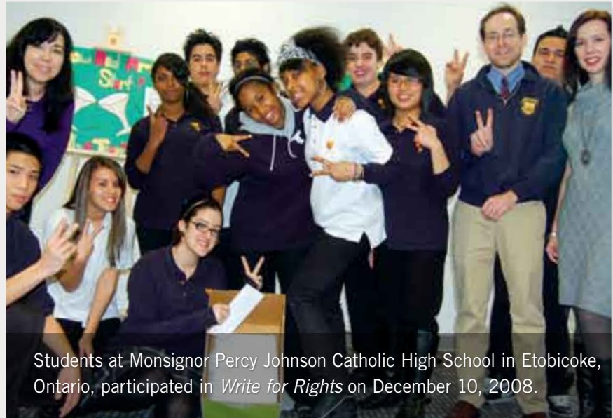
Students at Monsignor Percy Johnson Catholic High School in Etobicoke, Ontario, participated in Write for Rights on December 10, 2008.

The 60 th anniversary of the UDHR was also marked by Amnesty's Small Places event, a global festival of concerts, plays and exhibitions to which countless musicians, actors and painters gave their time, energy and enthusiasm to the cause of human rights.