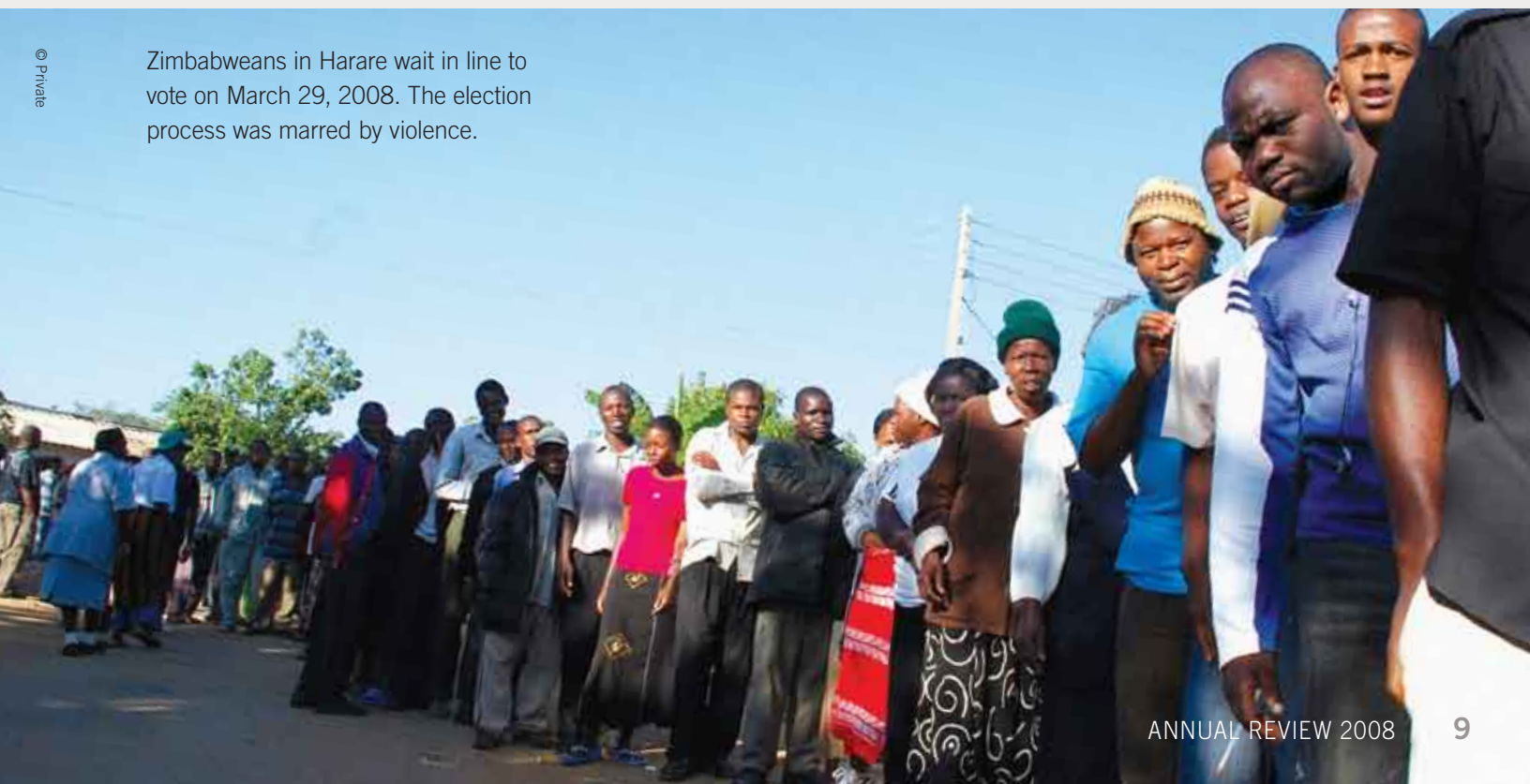
Zimbabweans in Harare wait in line to vote on March 29, 2008. The election process was marred by violence.