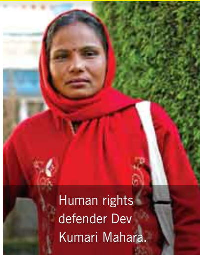
Human rights defender Dev Kumari Mahara.