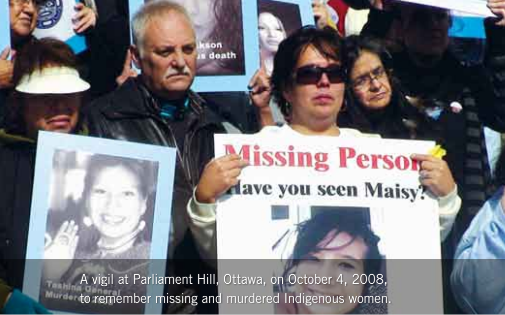
A vigil at Parliament Hill, Ottawa, on October 4, 2008, to remember missing and murdered Indigenous women.