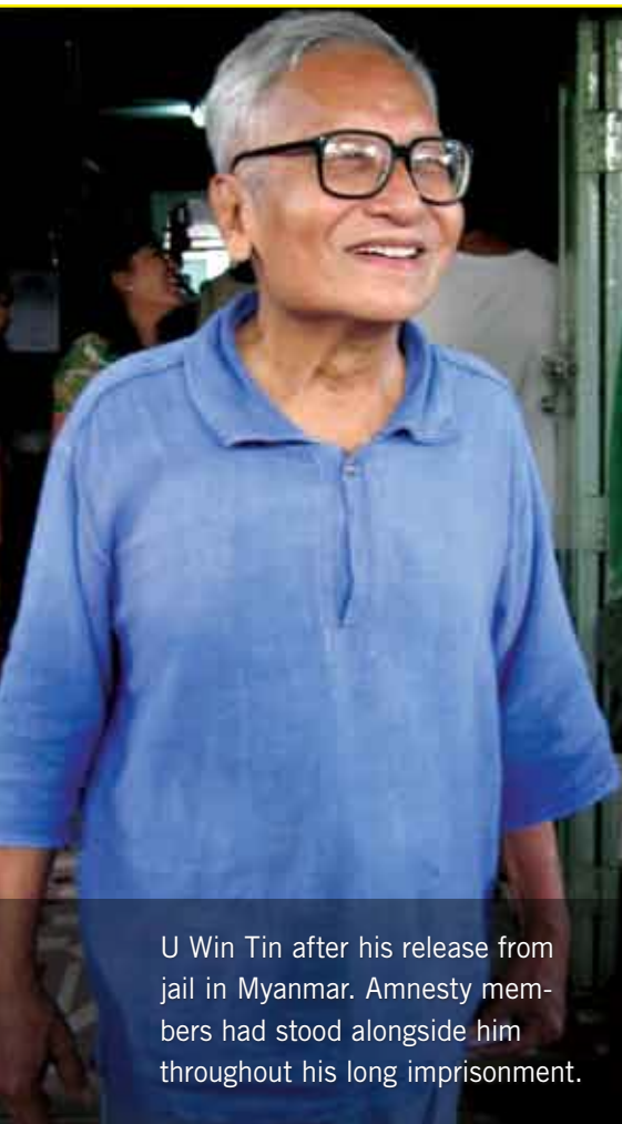
U Win Tin after his release from jail in Myanmar. Amnesty members had stood alongside him throughout his long imprisonment.

Although U Win Tin spent many years in jail in awful conditions, he remains firmly committed to his beliefs. "I will keep fighting until the emergence of democracy in this country," he told journalists after his release. He has reportedly resumed his work with the NLD and he has also visited the families of other political prisoners to offer his encouragement.