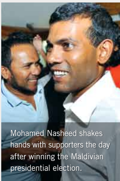
Mohamed Nasheed shakes hands with supporters the day after winning the Maldivian presidential election.