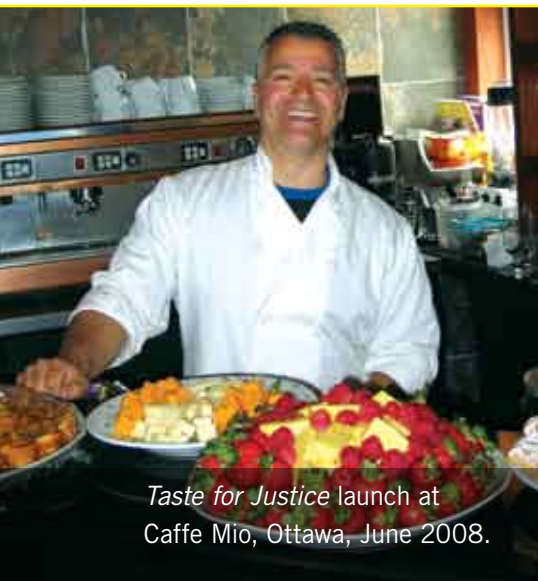
Taste for Justice launch at Caffe Mio, Ottawa, June 2008.

me strength. I want to thank them for not forgetting those nearest and dearest to me – that knowledge helped me remain determined."