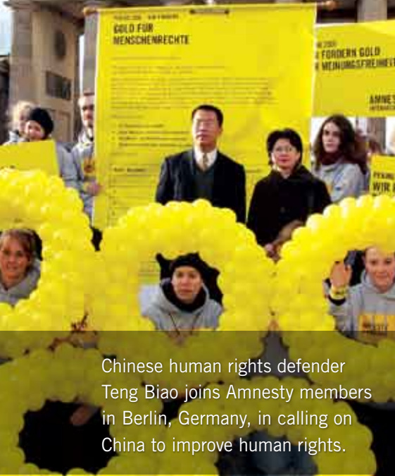
Chinese human rights defender Teng Biao joins Amnesty members in Berlin, Germany, in calling on China to improve human rights.