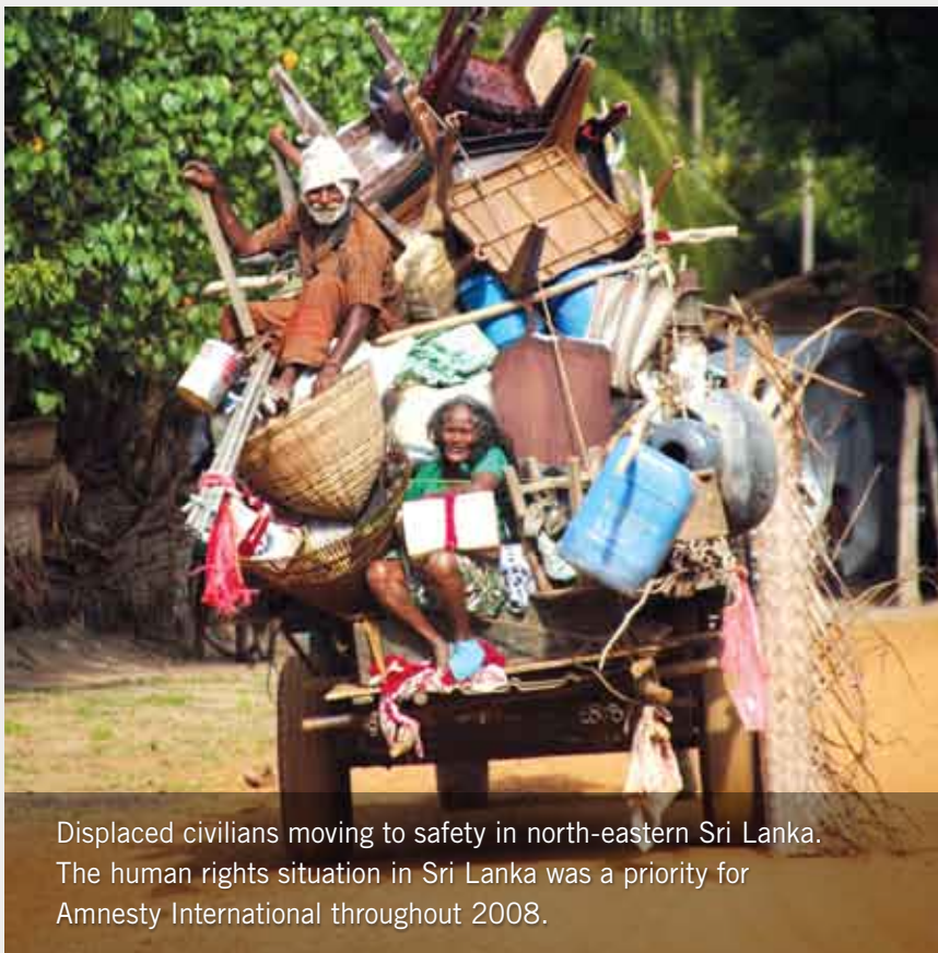
Displaced civilians moving to safety in north-eastern Sri Lanka. The human rights situation in Sri Lanka was a priority for Amnesty International throughout 2008.

Events in Sri Lanka were barely reported by the world’s media in 2008 although crises elsewhere in the world – in the Congo, Sudan and Zimbabwe – were widely covered. Very little news emerged because the Sri Lankan government and the LTTE deliberately kept aid workers, journalists and human rights organizations out of the conflict region. An important and challenging part of Amnesty’s work in 2008 was bringing the human rights crisis in Sri Lanka to global attention.