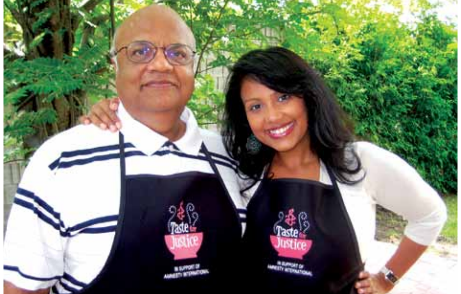
Amnesty International supporters share their Taste for Justice, June 2009.

You and friends can dine in and dine out this summer in support of Amnesty's work to protect and promote women's human rights.