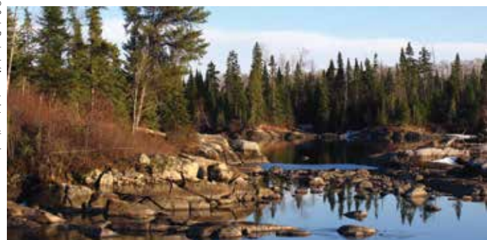
Mercury has polluted the waters of Grassy Narrows since the 1960s.

In the fall of 2017, however, the province finally agreed to fund a clean-up of the river system. Then the federal government announced that it would fund specialized medical care for those suffering from mercury poisoning. For more information, please go to amnesty.ca/grassy-narrows