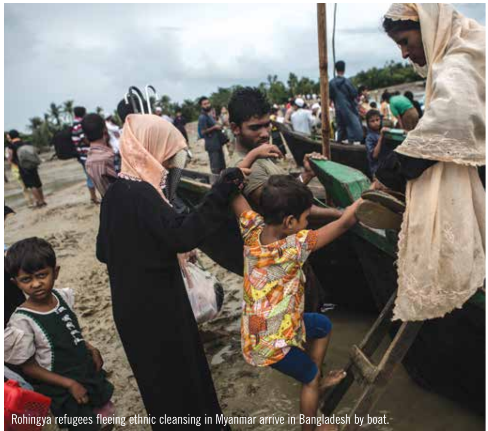
Rohingya refugees fleeing ethnic cleansing in Myanmar arrive in Bangladesh by boat.

The outpouring of compassion from Amnesty supporters in Canada to the crisis has been truly amazing. As long as the violence continues and crimes against humanity remain unaddressed, Amnesty will continue to take action to restore human rights for the Rohingya. To find out more, please go to amnesty.ca/rohingya-act-now