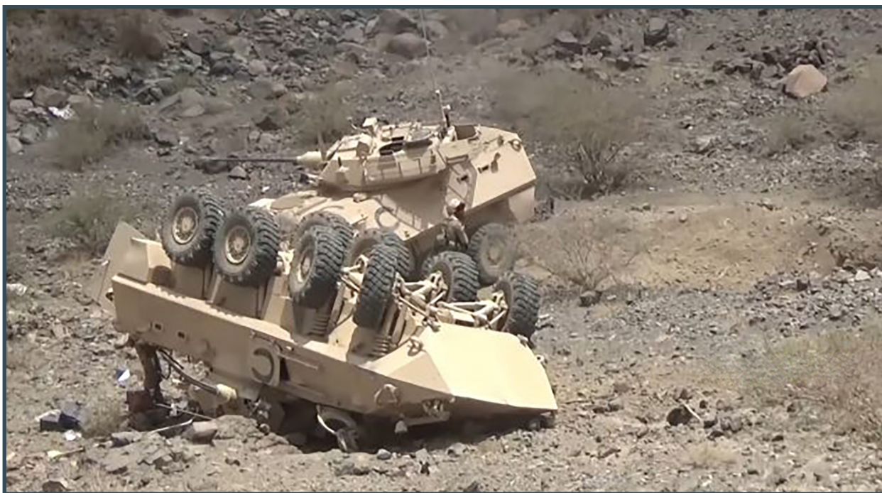
Two Canadian-made LAVs reportedly destroyed following clashes with Houthi militants in August 2019. 82