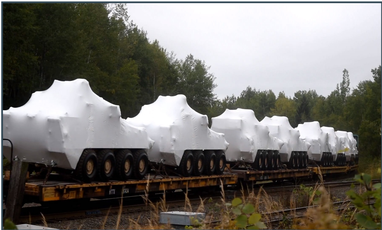
LAVs pictured outside of Moncton, New Brunswick, en route to the Port of Saint John for transport to Saudi Arabia, 18 September 2018. 219

Canada should thereafter fully incorporate all provisions of the ATT into the EIPA, including a definition of “substantial risk.” The government should then consider introducing greater parliamentary scrutiny of Canadian export controls, policy and practice, and complement it with the creation of an arm’s-length advisory panel of experts to review best practices and support State Parties’ compliance with the ATT. These considerations would not only ensure Canada’s full compliance with the international obligations to which it has acceded, but would also reduce the likelihood that Canadian weapons will be used to violate human rights abroad.