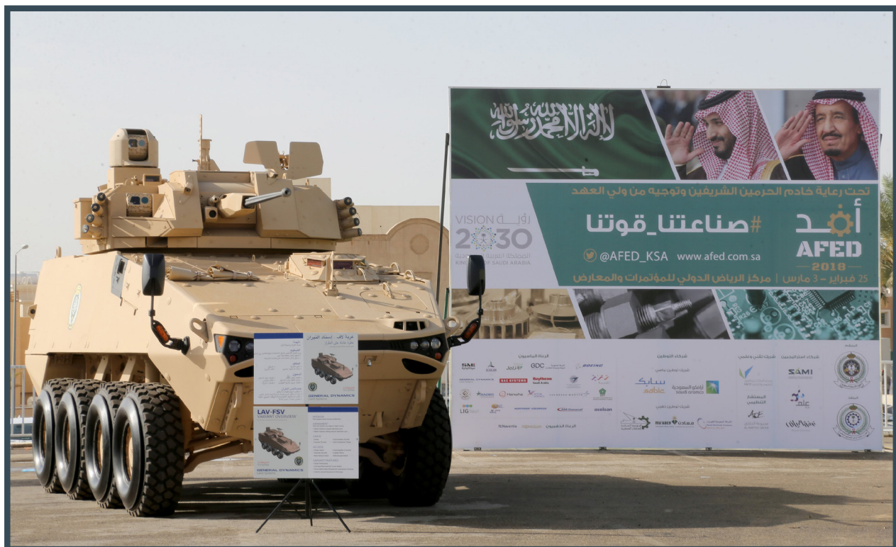
Canadian-made LAV 700 on display at the Armed Forces Exhibition for Diversity of Requirements & Capabilities (AFED) in Riyadh, Saudi Arabia, February 2018. 11