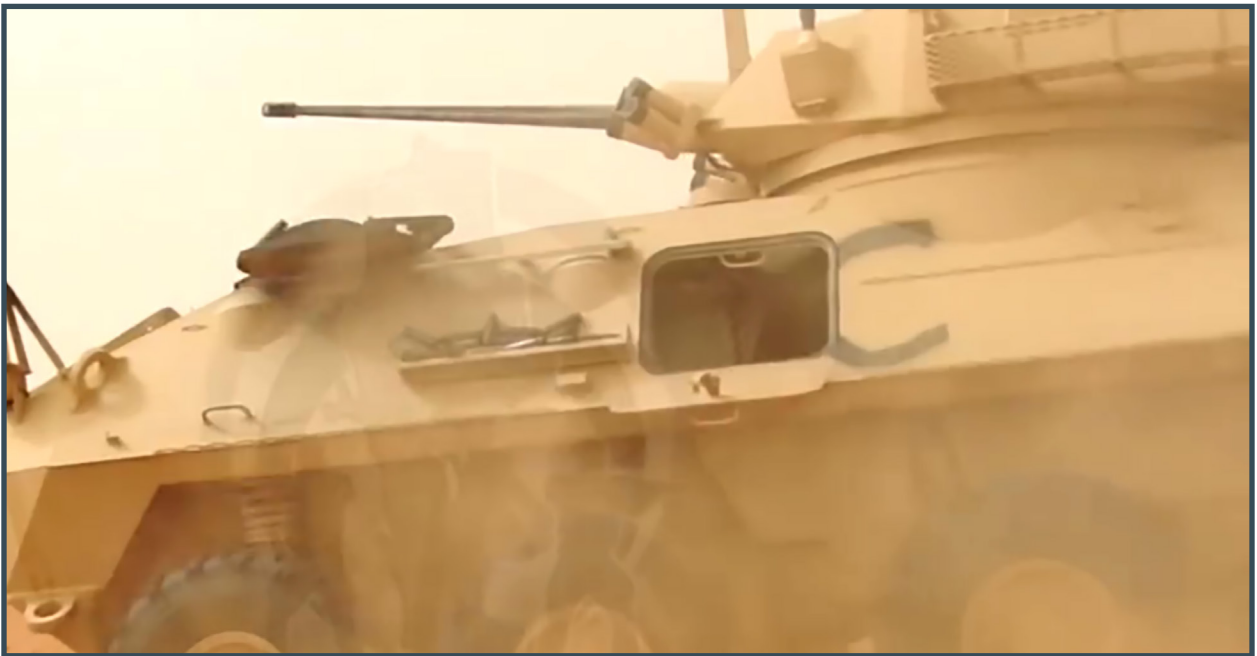
Canadian-made LAVs reportedly operated by Yemeni government forces in Hajjah Province, Yemen, second angle, May 2018. 210