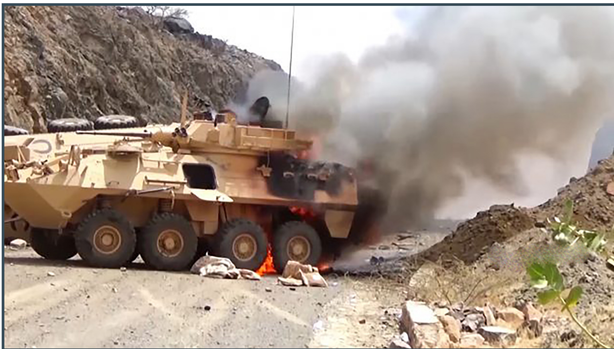
Canadian-made LAV-25 reportedly destroyed following clashes with Houthi militants in August 2019. 81