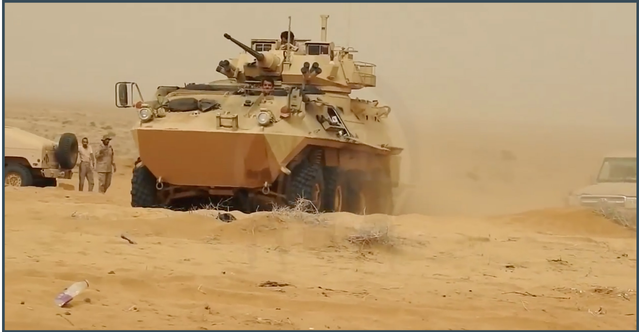
Canadian-made LAVs reportedly operated by Yemeni government forces in Hajjah Province, Yemen, May 2018. 209