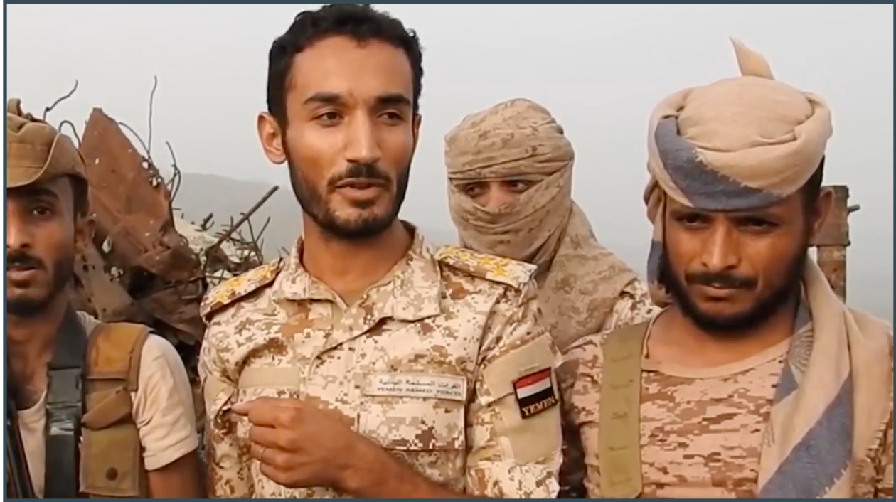
Brigadier General Mohammed bin Abdullah Al-Ajabi shown later in the same video, with Yemeni military uniform and Yemeni flag shoulder patch visible. 214

It is well established that PGW Defence Technologies has been a prime supplier of multiple varieties of sniper rifles to KSA. 215 According to the UN Register of Conventional Arms, KSA is also the sole member of the Coalition to have received Canadian sniper rifles since at least 2014, apart from four unspecified “rifles and carbines” 216 exported to Jordan in 2017. 217