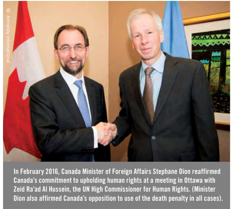
In February 2016, Canada Minister of Foreign Affairs Stéphane Dion reaffirmed Canada's commitment to upholding human rights at a meeting in Ottawa with Zeid Ra'ad Al Hussein, the UN High Commissioner for Human Rights. (Minister Dion also affirmed Canada's opposition to use of the death penalty in all cases).

The government has issued permits allowing a $15 billion deal to sell light armoured vehicle to Saudi Arabia, that had been approved by the former government, to go ahead. There has been no assessment released to the public indicating why the deal was approved despite Saudi Arabia's record of widespread human rights violations in the country and responsibility for extensive war crimes in neighbouring Yemen.