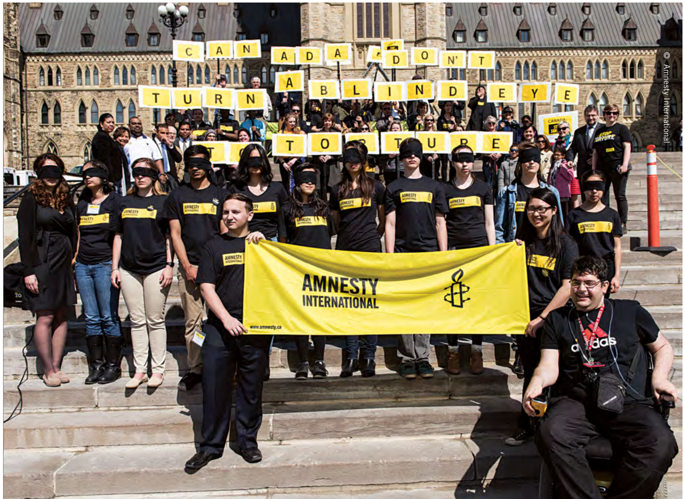
Amnesty Stop Torture demonstration on Parliament Hill, calling on Canada to be a strong international voice for torture prevention.

With concern growing about anticipated renewed backsliding on human rights in US national security practices, over the course of 2017 it will be more important than ever that Canada demonstrate that our approach to national security is grounded in firm respect for human rights.