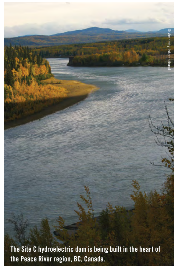
The Site C hydroelectric dam is being built in the heart of the Peace River region, BC, Canada.

Amnesty International's research, and a wealth of other studies by government agencies and independent researchers, has demonstrated the role of large-scale resource extraction, and the very large numbers of outside workers necessary to sustain the pace of development, in inflated local prices for necessities like housing, straining local services and infrastructure, and fueling problems of drug and alcohol abuse and violent crime in host communities. All of these strains further increase the risks to women who are already marginalized and impoverished. Governments have failed to allocate sufficient resources