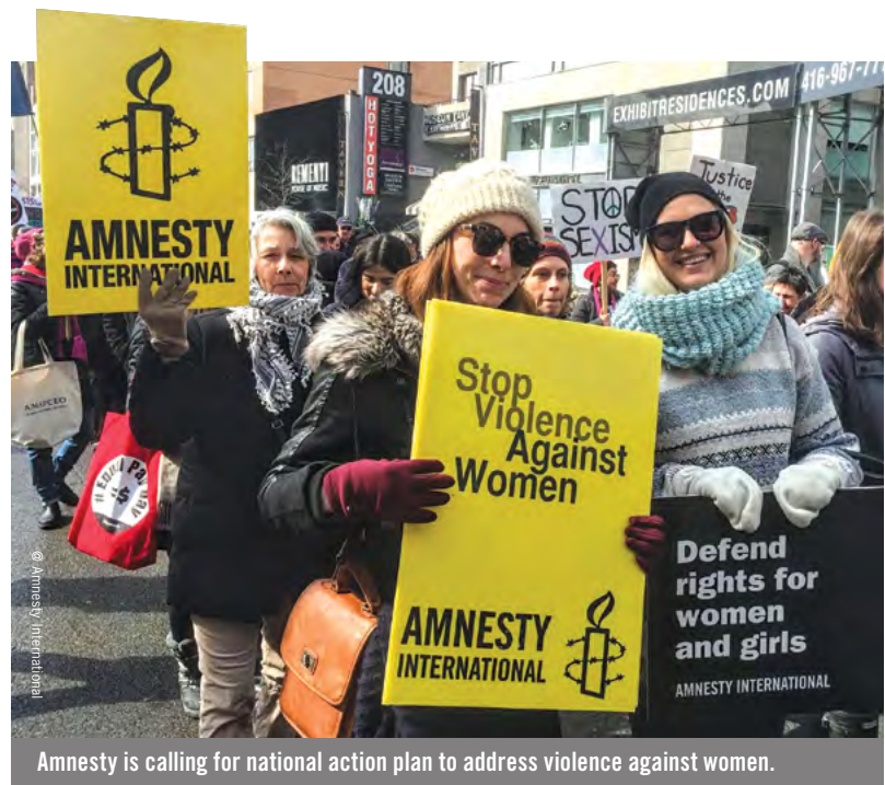
Amnesty is calling for national action plan to address violence against women.

Recognizing the violence and discrimination that women continue to face in so many parts of the world, ongoing threats to the safety and security of women's human rights defenders, and the valuable contributions that women-led and women's rights organizations abroad play in promoting gender equality,