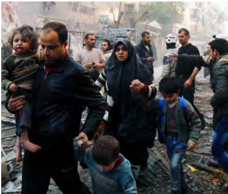
Beleaguered residents walk through debris from an airstrike in northern Aleppo earlier this year.

As this Human Rights Agenda is being finalized, the world is haunted by the agony of unrelenting bombardment, death and horrifying civilian hardship in Aleppo, Syria. Equally haunting as the levels and nature of the violence has been the utter inability of the international community to take action to end it. Throughout close to six years of opposition, protest, conflict and eventual all-out civil war in Syria, the UN Security Council has been deadlocked; effective action blocked by actual and threatened vetoes by Russia and China.