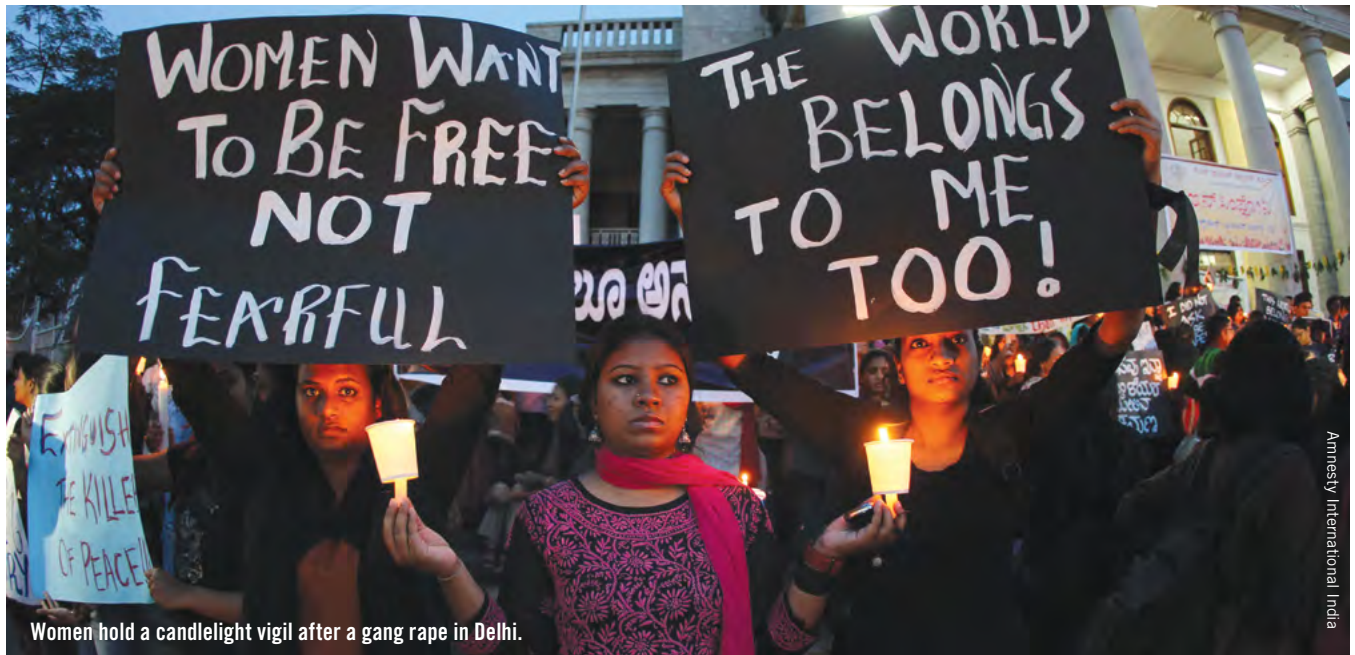
Women hold a candlelight vigil after a gang rape in Delhi.

Gender-based human rights violations continue at such an unrelenting scale because they are ignored and accepted. They remain largely unaddressed because entrenched impunity shields national governments from meaningful repercussions on the world stage and protects the individuals responsible for violence and abuse from facing consequences within national justice systems.