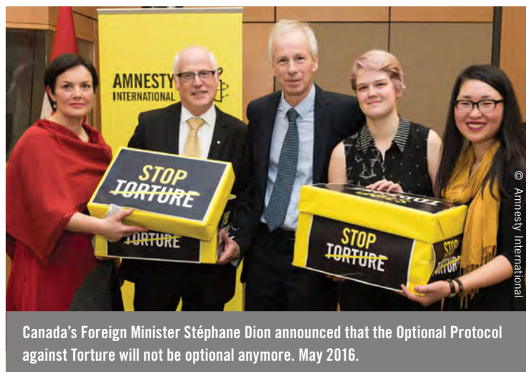
Canada's Foreign Minister Stéphane Dion announced that the Optional Protocol against Torture will not be optional anymore. May 2016.

Consequently, there is no reliable and consistent means of ensuring recommendations from the various international level human rights reviews and missions dealing with Canada's human rights record are effectively implemented. UN human rights bodies have expressed growing frustration over the years with respect to the lack of an effective system for ensuring proper coordination among governments in Canada