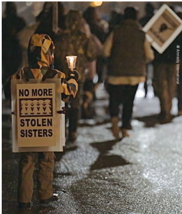
Annual vigil for missing and murdered Indigenous women and girls in Fort St John, British Columbia.

There has been no indication of how the government intends to proceed with implementation of the UN Declaration on the Rights of Indigenous Peoples. While in opposition, Liberal MPs had supported a private member's bill calling for review and reform of Canadian laws to ensure their consistency with the standards set out in the Declaration, collaboration with Indigenous peoples in the creation of a national implementation plan, and regular reporting to Parliament on progress toward implementation. A nearly identical private members bill – Bill 262 – introduced before the current Parliament has not been supported by the government nor has the government set out an alternative framework to meet these objectives. 24